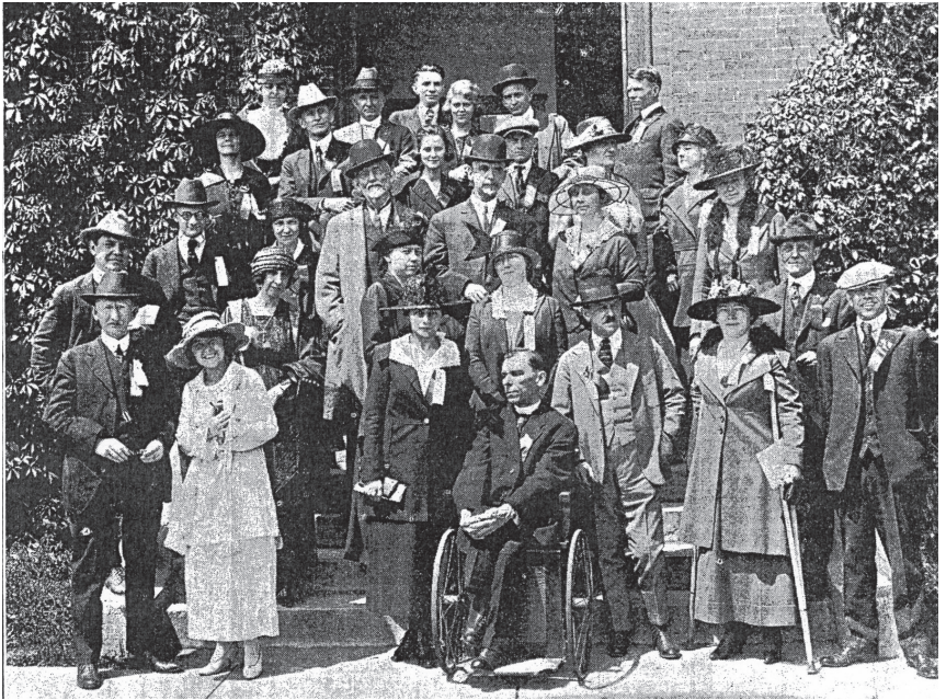
Some of the charter members from May, 1915